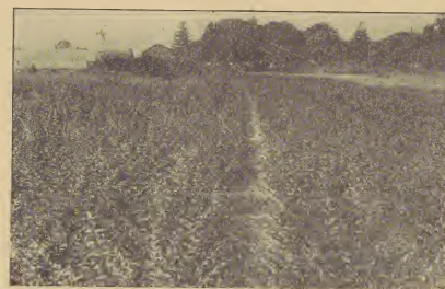
FOR HARDIER, MORE UPRIGHT HEDGES

LIGUSTRUM IBOLIUM (California Privet x Ibota)